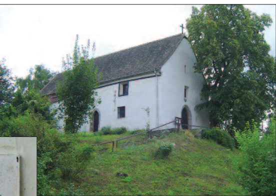
Figure 8. Miner's Church (N47° 56.11 E18° 49.59). This served originally the German Lutherans. Nearby is the St. Stephens Church (N47° 56.18 E18° 49.07), serving mainly the Hungarian population. See next figure for the plaque near the door.

Hungarian National Museum (Magyar Nemzeti Múzeum) (see Figure 5).