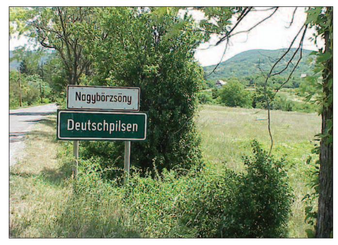
Figure 6. The sign announcing Nagybörzsöny, along with the German name of Deutschpilsen (N47° 56.20 E18° 48.93), reflecting the main culture of the early mining settlers, who were Saxons. The first Magyar settlers of Hungary settled here in the 10th century. "Nagy" means "big," and "börzsöny" means logwood. "Nagy" is a common prefix to Hungarian towns. "Nagybörzsöny" is pronounced "nadie-borz-sonyi."