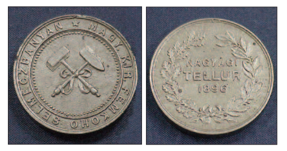
Figure 13. Tellurium coin, minted in 1896. The obverse (left) displays the crossed hammers (Note 1); the inscription is "Mag. Kir. Femkoho Selmeczbányán" ("Hungarian Royal Smelter at Selmeczbanya"). The reverse inscription is "Nagyági Tellur 1896" ("Nagyág tellurium 1896"). Nagyág (present name Săcărâmb) was the primary mine that Edward Daniel