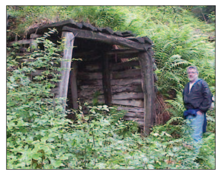
Figure 2. The Facebánya mine (Hungarian name), where tellurium was first discovered, in the western Romanian Carpathians, 84 km northwest of Sibiu (N46° 07.85 E23° 08.84). The mine is accessible by jeep from the village of Zlatna on primitive roads to a base camp high in the mountains, followed by a rugged 500-meter hike. The German name was "Faczebaya," used by Müller von Reichenstein in his publications; the transliterated Romanian name is "Faţa Băii." This was then part of Hungary—nearby abandoned mansions had Hungarian owners, whose names were inscribed on the stone walls, e.g., "1854 Kornyik György építtete"—translated as "In 1854 George Kornyik [had this house] built."

In his laboratory Müller von Reichenstein worked with various minerals with gold/tellurium compositions found in the mountains of Transylvania, known locally as the Apuseni Mountains, a branch of the Carpathian Mountains. His tellurium studies concentrated on minerals from the Facebánya mine (Figure 2), located in the higher altitudes of the Apusenis. When he prepared this new metalloid, he noted the radish-like odor when it was heated. Both tellurium and selenium are known for their radish or garlic-like odors; Berzelius when he discovered selenium three decades later initially thought he had discovered a new source of tellurium in Sweden.1d Müller called the metal aurum paradoxum or metallum paradoxum, referring to its occurrence in gold minerals and its metallic lustre.<sup>2</sup> Subsequently, tellurium was also found in nagyagite, a gold-tel-