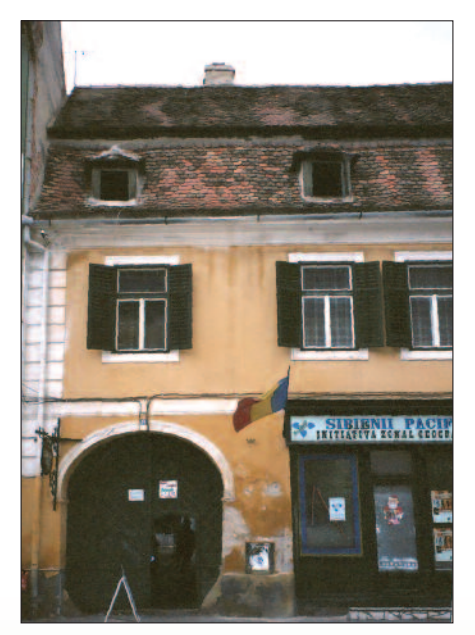
Figure 1. Laboratory of Müller von Reichenstein in Sibiu, Romania, where tellurium was discovered in 1782. Old address was Fleischer Gasse 36, modern address Str. [Strada = street] Mitropoliei 26 (N45° 47.68 E24° 08.83). The house is now used as a health food store.

Original tellurium discovery. In the very first issue of The HEXAGON"Rediscovery" series (16 years ago),1a we reported on the discovery of tellurium in 1782 by Franz Joseph Müller von Reichenstein (1740(42?)-1825). The analytical work was done in his home laboratory (Figure 1) in Sibiu in Transylvania. This historical region in present-day central Romania is perhaps best known for the setting of Bram Stoker's Dracula. The city of Sibiu, although in the Kingdom of Hungary, was settled mainly by Germans who named it "Hermannstadt," and its architecture reflects their culture. For example, the "Gaubenfenster" ("eye-windows" in the attic), previously seen in The HEXAGON article on nickel<sup>1e</sup> may be seen here, notably in the main square, Piața Mare (N45° 47.80 E24° 9.10). (When the authors visited Sibiu, their hotel was hosting a German reunion.)