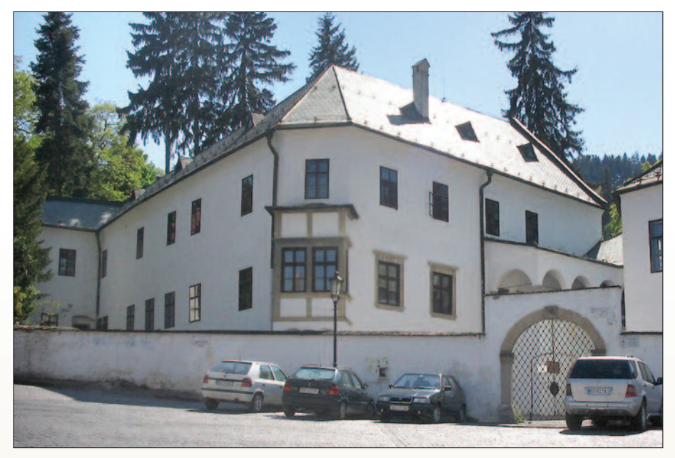
Figure 12. Belházy, the building where the chemical and mineralogical laboratories were located, starting in 1770 at the Schemnitz Mining Academy in Banská Štiavnica, Slovakia (1 Andreja Sládkovi a – N48° 27.52 E18° 53.48). This city and environs have been declared a UNESCO World Heritage Site. Notable chemists who were educated here include Josef Müller von Reichenstein, who discovered tellurium in present-day Romania, and A. M. del Río,<sup>1e</sup> who discovered vanadium in Mexico. Belházy was built in 1616, and was owned in 1756 by János Belházy, the mayor of Schemnitz.