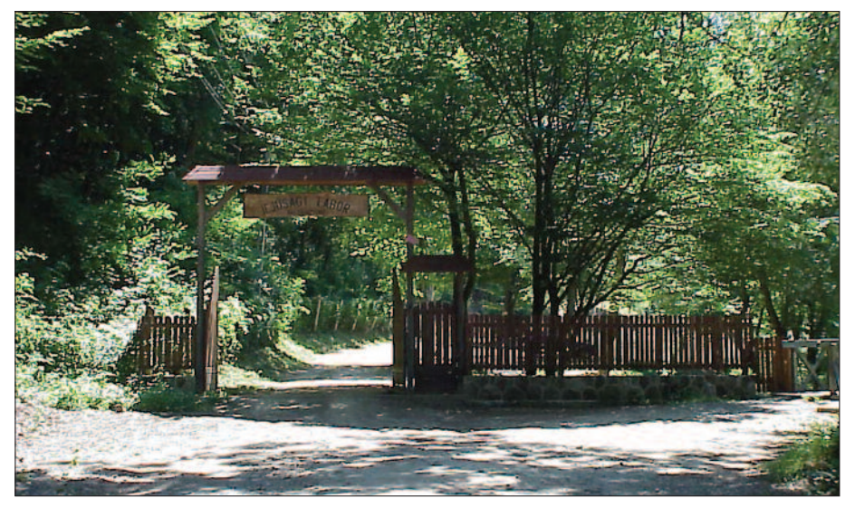
Figure 10. On the eastern outskirts of Nagybörzsony, one enters the Duna-Ipoly Nemzeti Park (Danube Ipoly National Park). (N47° 55.96 E18° 50.20). The park entrance overhead sign announces "IFJÚSÁGI TÁBOR NAGYBÖRZSÖNY," meaning "Nagybörzsöny Youth [Camp]." In the camp, at the foothills of the Börzsöny Mountains, are athletic fields and shelters for various activities for children. A narrow-gauge railway is available for short trips into the mountains.