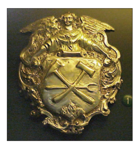
Figure 14. Gold-mining was a prolific source of wealth during Hungary's history. This resplendent miner's badge, dated 1731 and fashioned from gilded silver, is representative of the exhibits at the Hungarian National Museum in Budapest, Hungary. As large as a policeman's badge, it was worn on a miner's cap. The crossed hammers motif, so common in the history of European mining, originated in Kremnica in the Kingdom of Hungary (now present-day Slovakia).

Figure 16. This is a small portion of the three-panel fresco produced in 1983 by Rátkay Endre (Andrew Rátkay, 1928-2011) in the Harmony Room of the Institute of Physics of the Eötvös Loránd University. The entire fresco, composed of three 2.17 x 4.50m panels, is an unusual Greco-Roman/surrealistic interpretation of 25 famous scientists and philosophers (Note 2). The persons in this figure are (left to right) Newton, Eötvös, and Kitaibel. Notice that Kitaibel is not portrayed as a chemist, but as a botanist, sheathed in an interlacing tunic of vines. Above Eötvös is his rule (equation) for surface tension. Eötvös is pointing to the falling bodies of Newton; surrounding Newton are contributions from his Principia, symbolizing the interplay of falling, revolving, and oscillating (pendulum) bodies, all described by the universal principle of gravitation—and all suspended above and thus superseding the earlier beliefs of Aristotle.